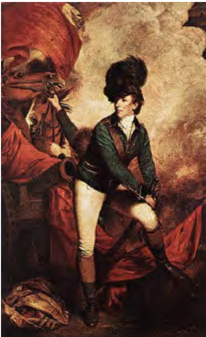
Lieutenant-Colonel Banastre Tarleton by Joshua Reynolds.

I find no evidence of the situation as it related to Washington as the Commander-in-Chief of all American land forces. I do find that Washington looked on his troops as a triad. The upper level was the Continental Army, which could, and did stand up to British Regulars on their own terms when the numbers were anywhere near evenly matched. The middle level were the guerillas, such as Sumter, Marion and Pickens, who used Indian tactics to surprise, or harass the enemy, destroying stores and equipment, but never planning to take and hold towns or territory. They could, and were used at times to back-up the Continentals while Morgan at Cowpens defeated Tarleton in open battle. The lowest tier was the militia. Washington realized that they were not reliable in the face of British soldiers with bayonets. He could and would use them according to their capability and dependability to assist the Continentals in winning the war..