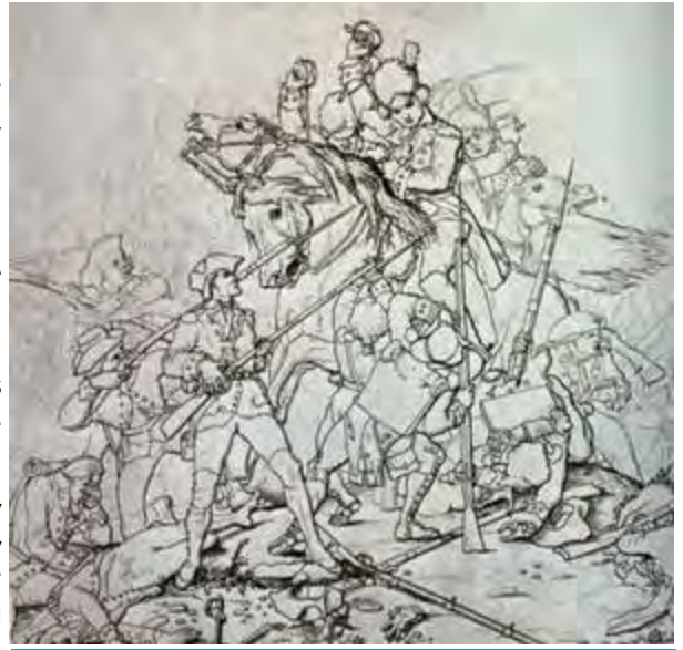
Sketch of the Waxhaw Massacre thought to be for a 19th century lithograph.

became the American battle cry. While Tarleton led a charmed life and escaped the war unscathed, Tories would pay at King's Mountain for the unnecessary slaughter at Waxhaw.