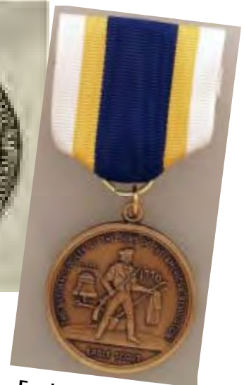
Eagle Scout Award.

This month's meeting will be held at noon on Saturday, May 8th, at the Carmichael Elk's Lodge, located at 5631 Cypress Avenue in Carmichael. No raffle will be held at this meeting!!