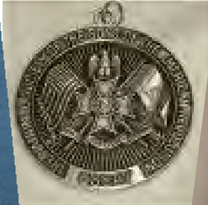
Knight Essay Contest Award