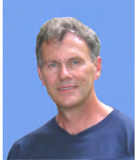
Michael Lucas Gold Country Chapter

The example set by the signers of the Declaration of Independence was followed by our patriot ancestors. These patriots were willing to pay the heavy price in defeating Great Britain and securing our independence. During the darkest days of the Revolutionary War, Thomas Paine had to remind the nation in The American Crisis that "tyranny, like hell, is not easily conquered" and "what we obtain too cheap, we esteem too lightly: it is dearness only that gives everything its value". Because of their willingness to pay the price, some ended up languishing in prison ships; some lost limbs; others lost loved ones; many lost their possessions; and too many lost their lives. The sacrifices crossed all gender, racial, and status lines. Men and women, black and white, free and enslaved, elite and commoner, and soldiers from the lowest to the highest ranks were willing to give their all for the American cause. Here are the stories of a few representatives of these patriots. They include Thomas Nelson of Virginia, a signer of the Declaration of Independence, Levi Hanford, a 17 year old Connecticut militiaman, Sally St. Clair, a Creole girl from South Carolina, Lambert Latham, a slave from Connecticut, and George Washington, the nation's Commander-in-Chief.