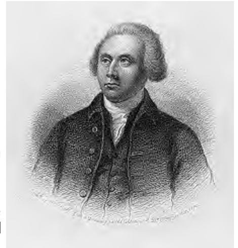
Thomas Nelson 1738 - 1789 Signer of the Declaration of Independence

The freedom our nation enjoys today came as a gift from those patriots who triumphed with their selfless determination. Thomas Paine wrote "These are the times that try men's souls: The summer soldier and the sunshine patriot will, in this crisis, shrink from the service of his country; but he that stands it now, deserves the love and thanks of man and woman". Let us make this Independence Day a tribute to those brave and selfless patriots who have given us our freedom and independence and deserve our "love and thanks".