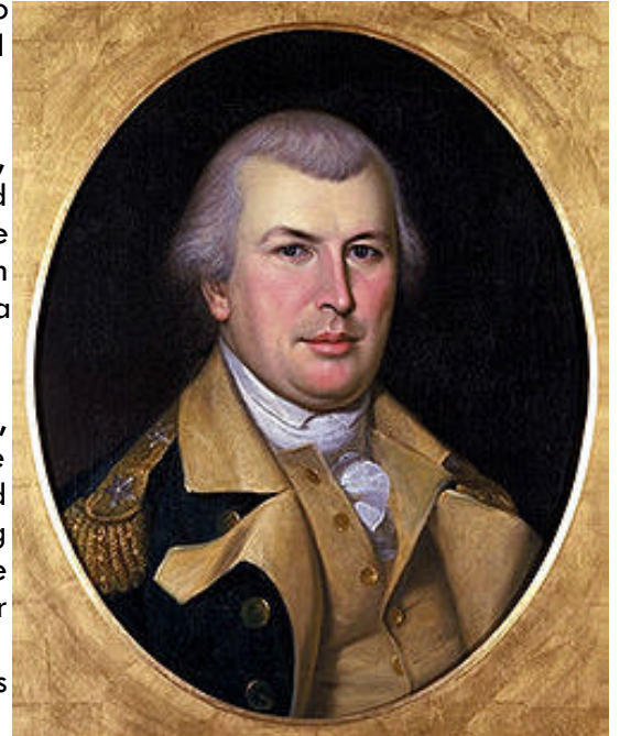
Major-General Nathaniel Greene

Cornwallis saw things differently. He had always believed that the key to holding the South, and thereby winning the war, was to hold the state of Virginia. This belief had been a bone of contention between him and Clinton all along. Aggressive by nature, he wanted to take action to make things happen. Under Clintons orders, he felt trapped and confined in Charleston. London also saw a need for action and allowed Cornwallis to override Clintons orders by giving him free rein to attack the problem as he saw fit.