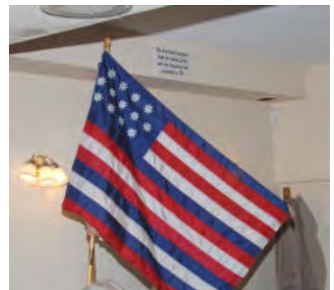
The Serapis Flag.