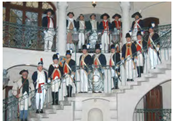
The CASSAR Color Guard at the Mission Inn in Riverside.